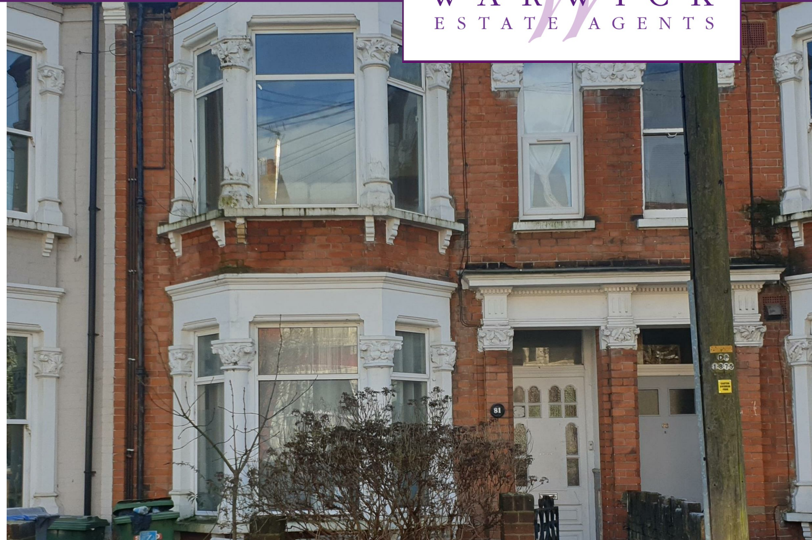
Buchanan Gardens, Kensal Rise, NW10 5AA